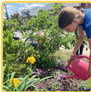
CARING FOR OUR TANSLEY NEIGHBOURS