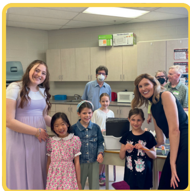
FAMILY FUN DAYS